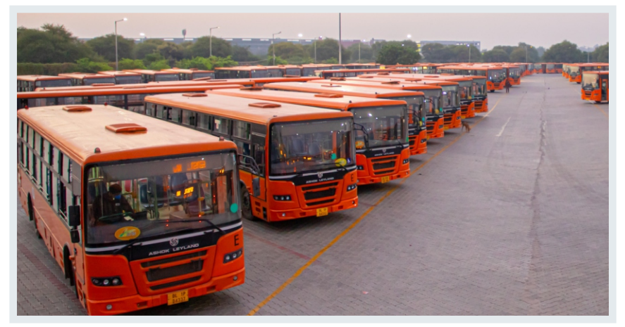
A Govt. of NCT of Delhi Project: Dwarka Bus Depot.

"Difficulties in your life do not come to destroy you but to help you realise your hidden potential and power. Let difficulties know that you too are difficult." - APJ Abdul Kalam