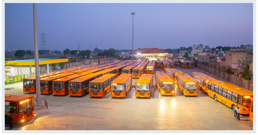
A Govt. of NCT of Delhi Project: Rewla Khanpur Bus Depot.

"No act of kindness, no matter how small, is ever wasted." - Aesop