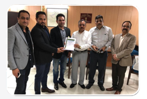
Agreement Signing Ceremony with Govt of NCT of Delhi