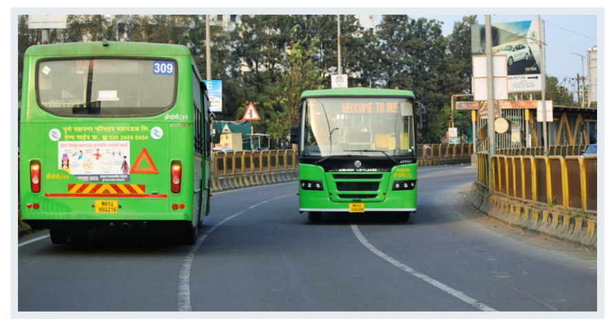
One of the first fully operational BRTS system PMPML - Project (Antony Garages P Ltd.)

"The greatest glory in living lies not in never falling, but in rising every time we fall." - Nelson Mandela